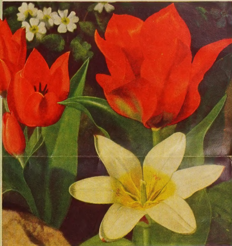
Praestans Fusilier, 12 for $1.60; Red Emperor, 12 for $1.40; Kaufmanniana, 12 for $1.75.